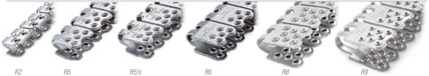
Flexco® Rivet Hinged Fastener Selection Chart

Use the charts below to match the Flexco® SR™ fastener to your needs. Find the fastener metal type required for your application. Then choose the ordering number that corresponds to your belt's width from the charts on the following pages.