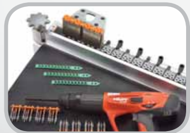
Select installation method.