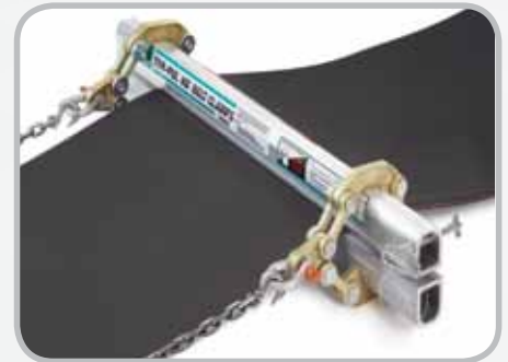
Far-Pul® HD® Belt Clamp