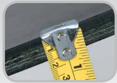
Measure belt thickness.