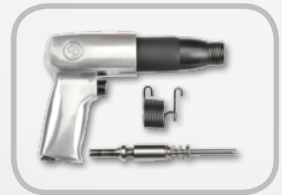
Air Powered Rivet Driver

*Includes Air Powered Rivet Driver, Retaining Spring, and Drive Rod with Hold Down Spring and Washer.