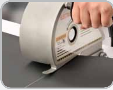
Electric Belt Cutter