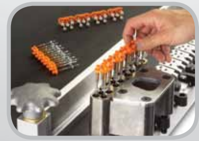
Speed Installation Time