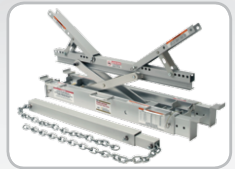
Flex-Lifter™ Belt Lifter