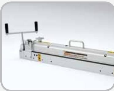
900 Series* Belt Cutter