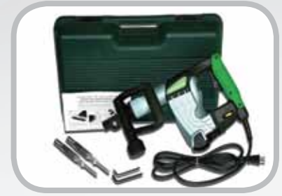
Electric Powered Rivet Driver

*Kit includes Driver, two Custom Drive Rods, Convenient Carrying Case