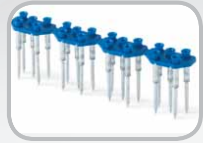
Rapid Loader™ Collated Rivet Strips