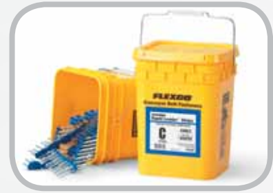
Conveniently packed, easy-to-use