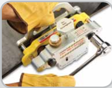
FSK™ Belt Skiver