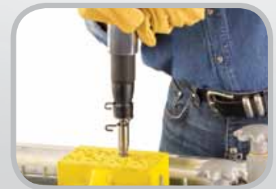
Air Powered Rivet Driver Installation