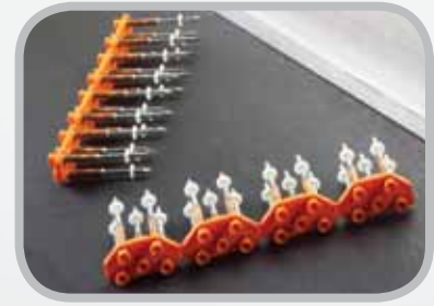
Rapid Loader™ Collated Rivet Strips with washers