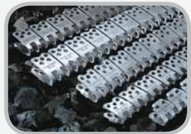
Select fastener size.