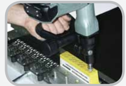
Electric Powered Rivet Driver Installation