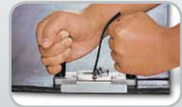
Flexco® Belt Groover